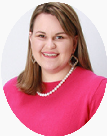
Junior Events - Congress Only - Mackie Storage Virginia

I hope that everyone is excited about the Junior Membership Luncheon at Continental Congress! At the luncheon, the accomplishments and achievements of Juniors over the last year will be shared and celebrated. All state Outstanding Juniors for this year and those who have Paged for over ten years at Congress are recognized during the luncheon. It is a great time!