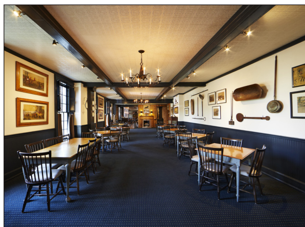
The Golden Lamb Blackhorse Tavern

On our final day, we will depart Illinois on our route back to Iowa. Enjoy a final group lunch stop in the city of Davenport before we continue our homeward-bound adventure toward Des Moines. B, L 🌍