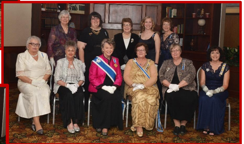
The 2016-2018 ISDAR District Directors. Looking beautiful and ready to serve in new ways.