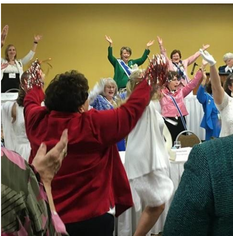
Are we having fun – or what ! ? !