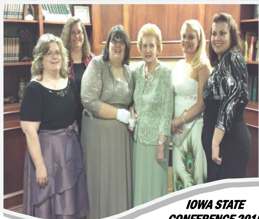
IOWA STATE CONFERENCE 2015