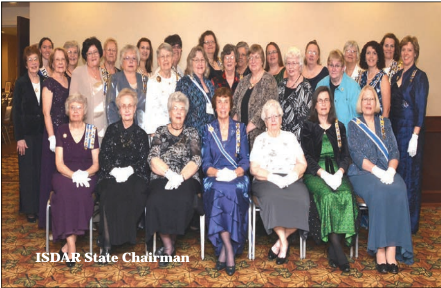
ISDAR State Chairman