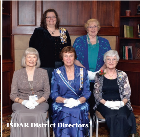
ISDAR District Directors