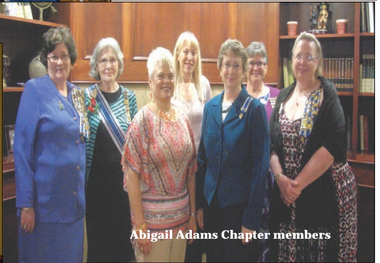
Abigail Adams Chapter members