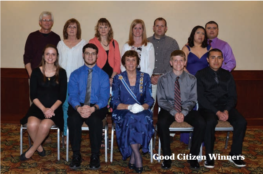
Good Citizen Winners