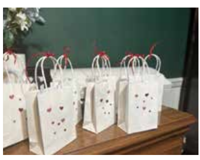
Nursing Home Veteran Gift Bags

The chapter also visits the local Veteran's Administra tion Clinic and local nursing homes with cards and gift bags several times to thank all the Veterans for their service.