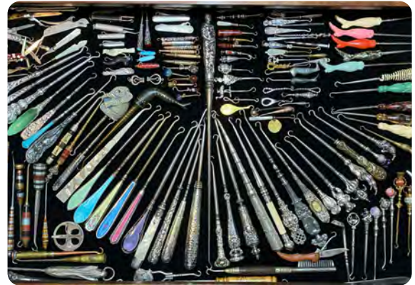
Button Hook collection pictured below

She shared her vast knowledge on the subject and showed members some of her collection of button hooks. This fascinating program captured the interest of all who attended.