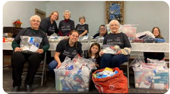
Mason City Chapter members with kits

Chapter members holding the completed kits can be viewed in following column.