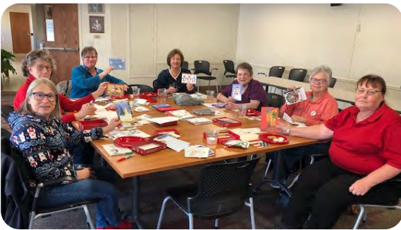
Jean Espy Chapter members working on cards