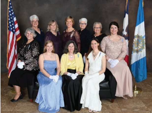
State Officers before installation