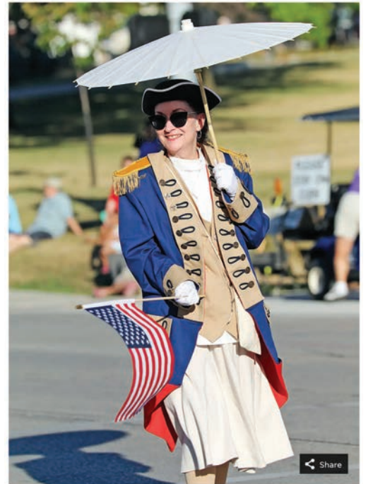
The Daughters of the American Revolution pass by during the 2022 Iowa State Fair Parade as spectators watch the state's largest parade with an estimated 200 floats, dignitaries, marching bands, vehicles, and performing units as it travels west from the State Capitol Complex along East Grand Avenue to 15th Street in Des Moines.