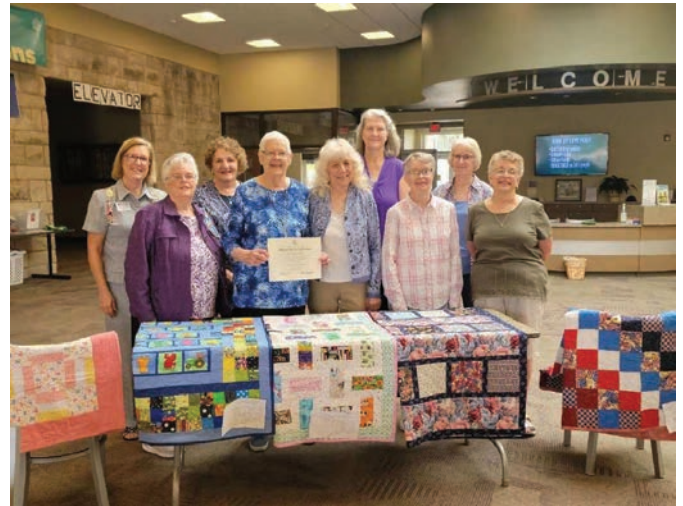
Quilters and Stitches Group

The Cedar Falls Chapter of the Daughters of the American Revolution presented two Community Services Awards at their August 20, 2022 meeting. Individuals and/or organizations are recognized for their outstanding community service. This year, the chapter presented two awards. The first was given to Quilters and Stitches group from First United Methodist church in Cedar Falls. The group made 370 school bags filled with supplies in 2021; made 50 quilts for children in foster care; donated 25 quilts for Black Hawk County Adoption Day; made quilts for baptisms, comfort quilts and Habitat for Humanity.