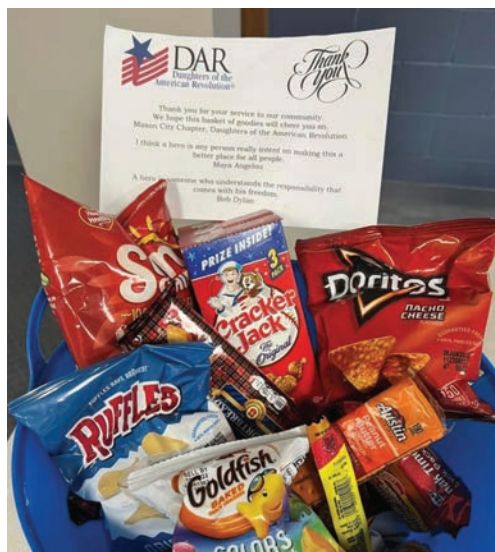
Hero Basket Example