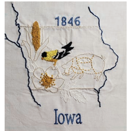
In progress quilt block.