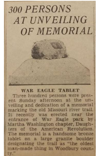
Excerpt from newspaper clipping of Monument Dedication May 29, 1929