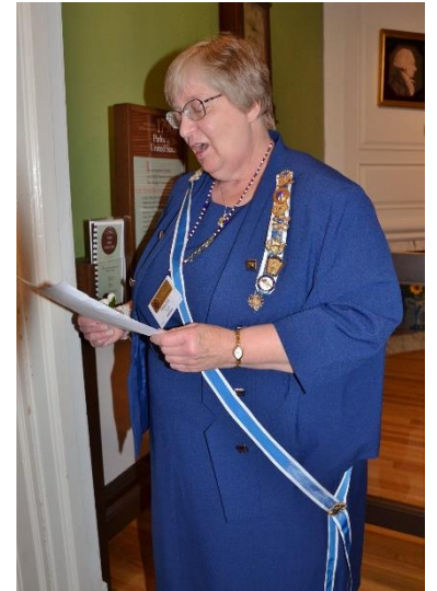
State Regent Marsha Hucke dedicates the new draperies.