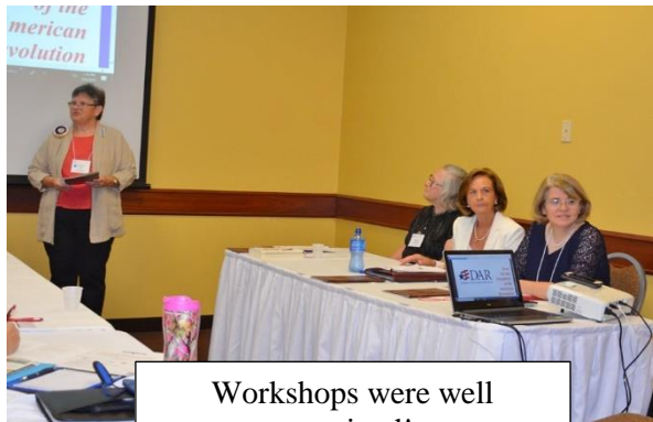
Workshops were well received!