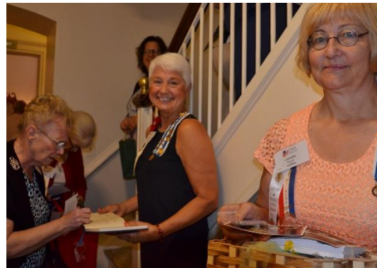
Iowa Members greet Daughters and attendees at the Open House.