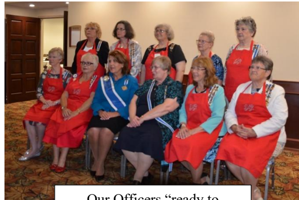
Our Officers "ready to serve"!