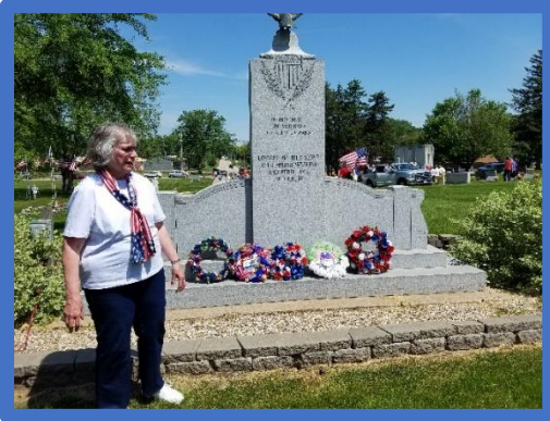
Soldier at Harlington Cemetery.