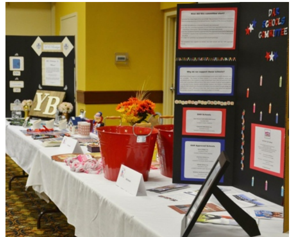
Lots of work went into displays around the room sharing DAR committees in action.

Towa's Daughters Towa's Daughters Towa's Daughters Towa's Daughters