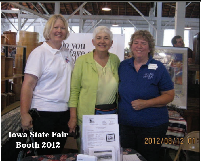
Iowa State Fair Booth 2012